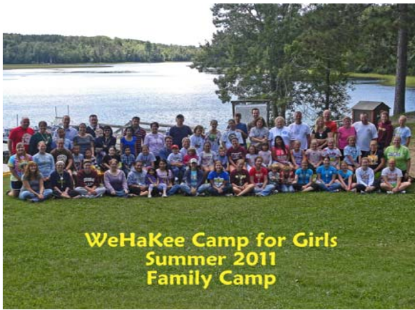
WeHaKee Camp for Girls Summer 2011 Family Camp